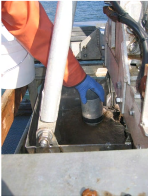
Figure 1. Sub-sampling from powered Van Veen Grab