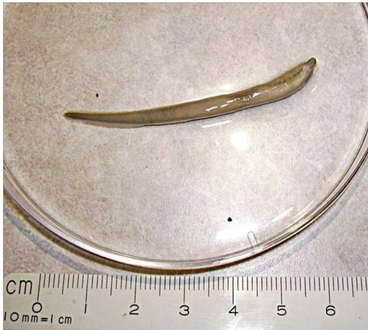
Figure 9. Lamprey ammocoete