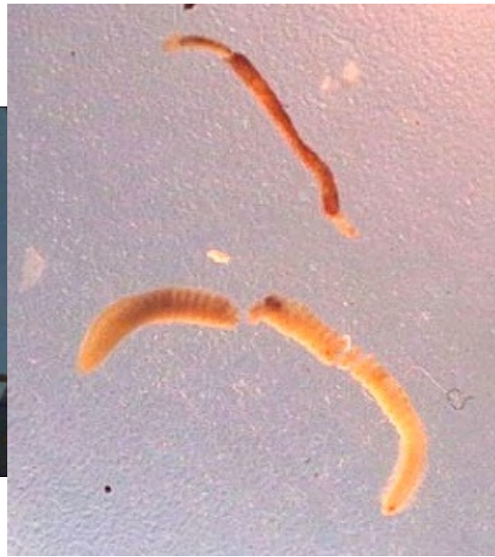
Figure 7. Oligochaete specimens