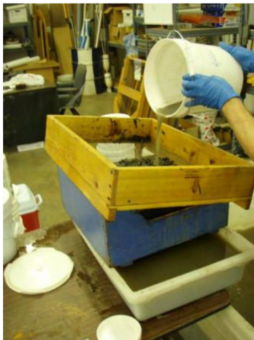
Figure 2. Initial invertebrate sample washing