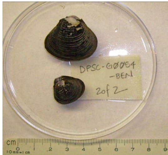
Figure 8. Asian clam ( Corbicula fluminea )