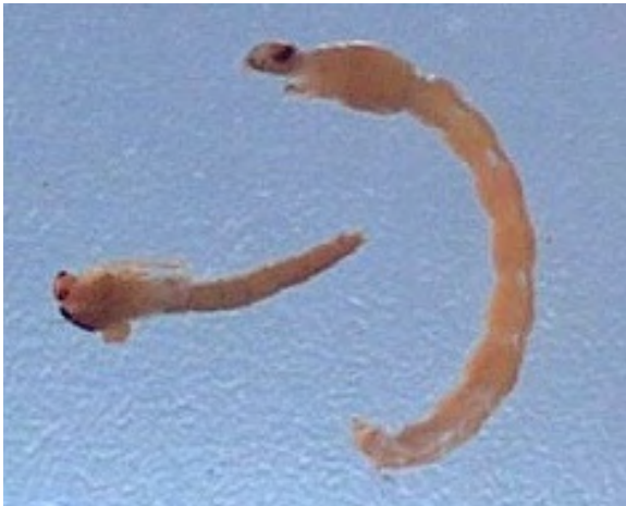
Figure 6. Chironomid larva (larger specimen) and pupa (smaller specimen)