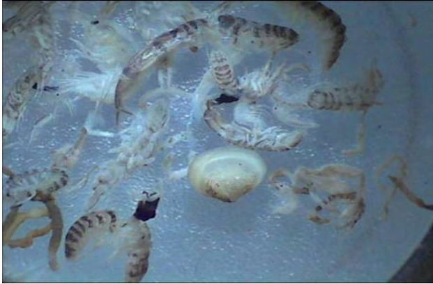
Figure 5. Example of sorted sample invertebrates during taxonomic identification; specimens include Corophium and Gammarid amphipods, clam, oligochaetes