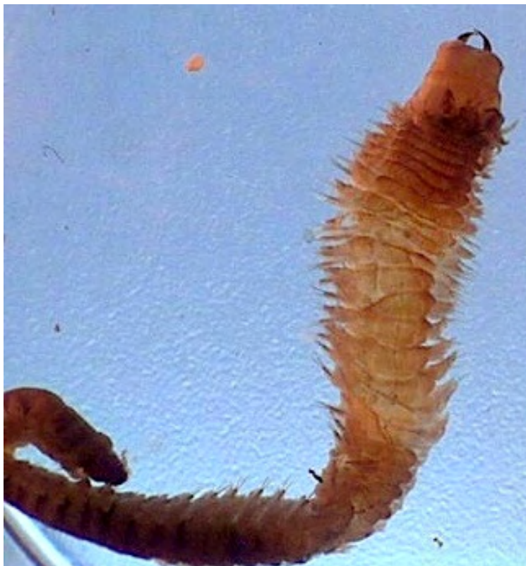
Figure 10. Freshwater polychaete, family Nereidadae