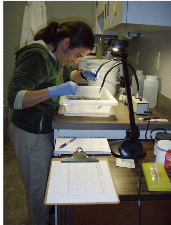
Figure 3. Invertebrate sample sorting